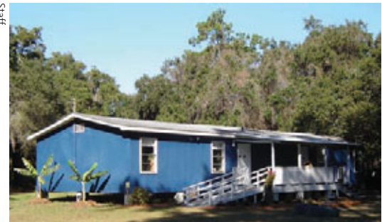
With two rooms, the new Hog Hammock facility is one of the smallest public libraries in Georgia.