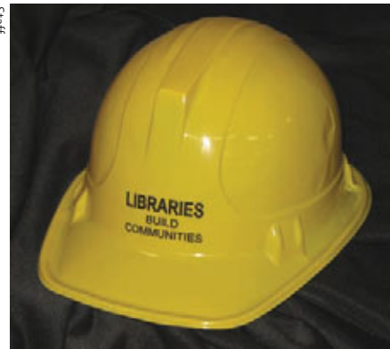
Georgia Library Day attendees will receive commemorative replica hard hats.